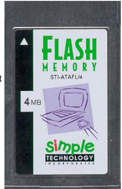
Flash Card (shown actual size)