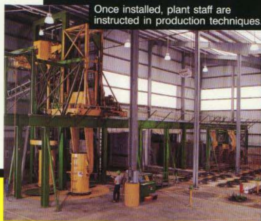
Once installed, plant staff are instructed in production techniques.

"Besser / DeVere turnkey services meant we (Tarmac) didn't need to get involved with the daily pile of details involved with a greenfield project. I was impressed with their adherence to timetables and their overriding concern for quality. I am looking forward to working with Besser / DeVere on the next new concrete products plant Tarmac embarks upon."