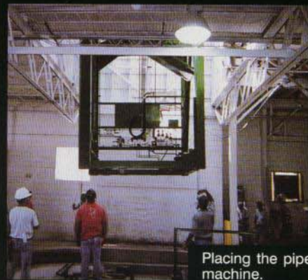
Placing the pipe machine.